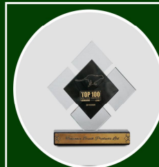
TOP 100 MID-SIZED COMPANIES 2020