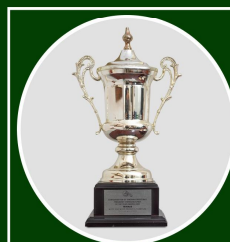
CONFEDERATION OF TANZANIA INDUSTRIES PRESIDENT'S MANUFACTURER OF THE YEAR AWARDS 2009