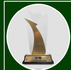
TOP 100 MID-SIZED COMPANIES 2013 - 2014