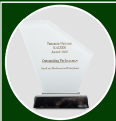
TANZANIA NATIONAL KAIZEN AWARD 2020

We believe that quality sells by itself Our reputation as a manufacturer has been recognised with many awards in recent years, with a collection of awards highlighting our manufacturing achievements.