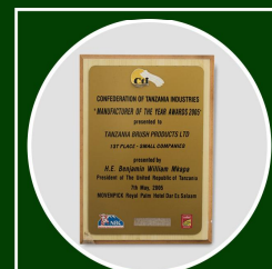
CONFEDERATION OF TANZANIA INDUSTRIES PRESIDENT'S MANUFACTURER OF THE YEAR AWARDS 2005