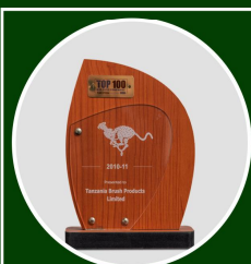
TOP 100 MID-SIZED COMPANIES 2010 - 11