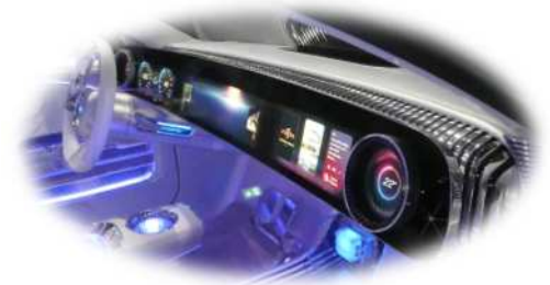
Mercedes-Benz Concept CLA | IAA 2023