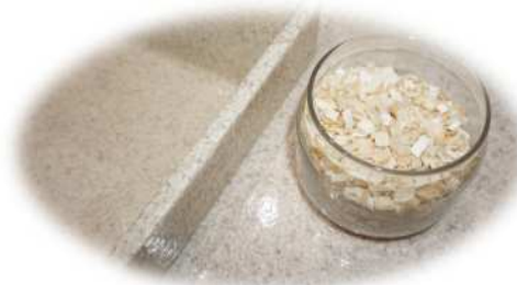
Woodio Sink | ISH 2023