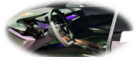
Cupra RAVAL | IAA 2023