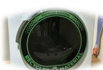
Midea Washer Dryer | IFA 2023