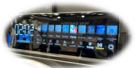
Washing Machine Control Panel CHIQ | IFA 2023 | 2