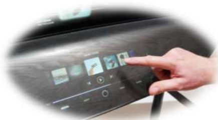
Continental Hidden Display | IAA 2023