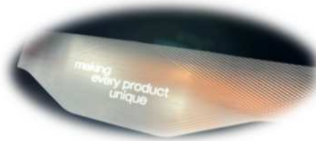
LEONHARD KURZ Stiftung & Co. KG | Fakuma 2023