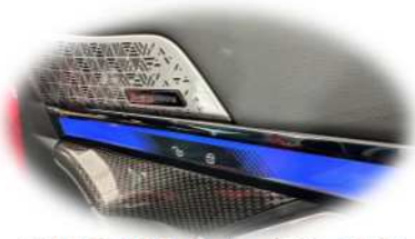
BMW i5 M60 xDrive | IAA 2023