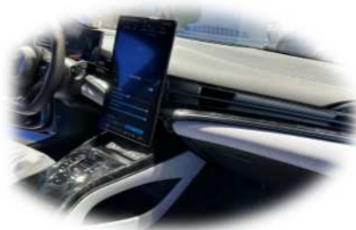
BYD Seal | IAA 2023