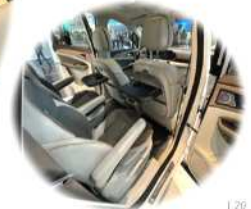
Dongfeng Forthing U-Tour