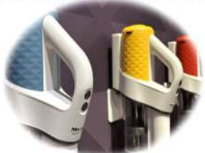
Miele Duoflex HX1 | vacuum cleaner